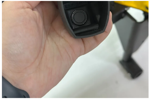
Round magnet inside the Protector