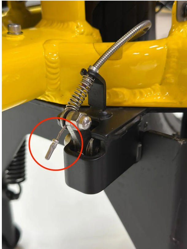
Cable end, located above the GSD kickstand's base plate

Step 4: Insert the cable end into the small gap in the kickstand's base plate, as highlighted in the image below.