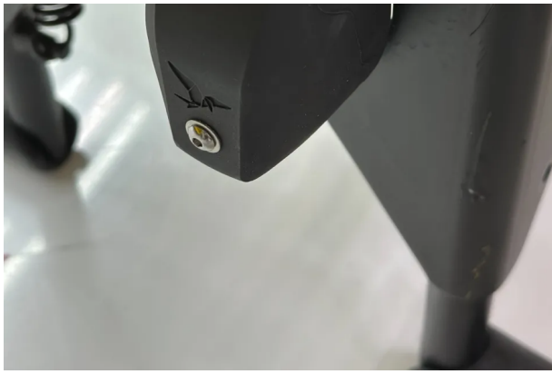
Lockstand Protector Gen 2 appearance