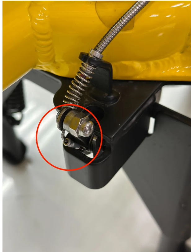
Cable end bent into the small gap of the kickstand's base plate

Step 5: Place the protector over the Lockstand.